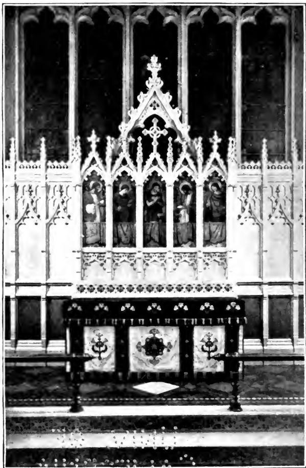
THE REREDOS WITH THE BURNE-JONES PANELS. AT CHRIST CHURCH, WOBURN SQUARE, IN MEMORY OF CHRISTINA ROSSETTI.